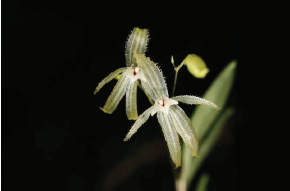
Figure 2. Andinia sunchubambensis flower detail of the holotype, photographed in situ in Paucartambo, Peru.