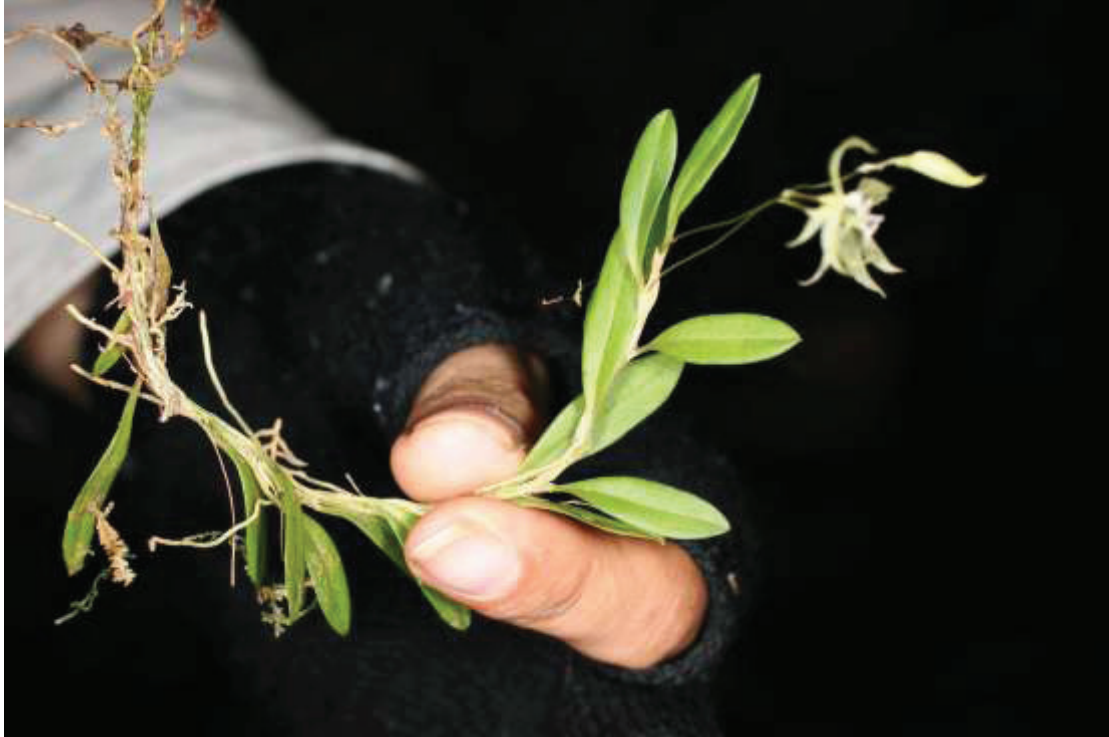
Figure 3. Andinia sunchubambensis habit of the holotype, photographed in situ in Paucartambo, Peru.